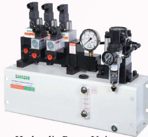
Air Driven Hydraulic Pump Unit 氣動油壓泵浦單元