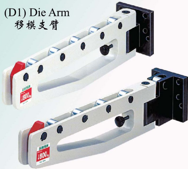
(D1) Die Arm 移模支臂