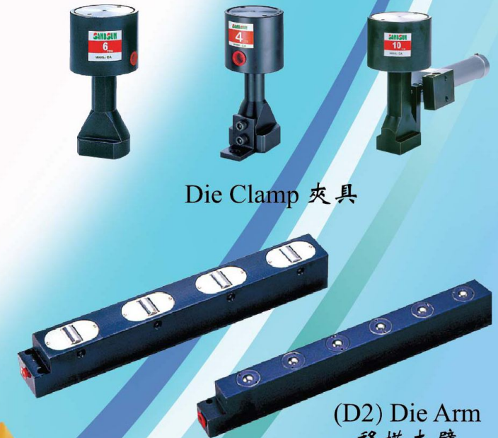
(D2) Die Arm 移模支臂