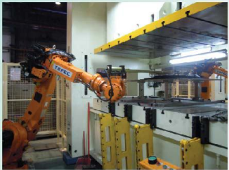
Robot Transportation Line 機械手臂搬運生產線