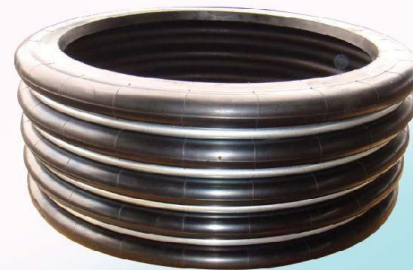
Air Spring 氣壓式彈簧