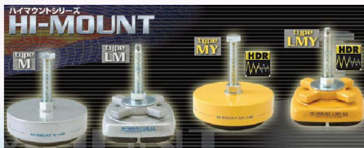
Vibration Pad. for Press Machine 冲床用防震脚