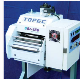
NC Roll Feeder 數控式滾輪送料機