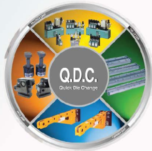
Q.D.C. System for Press Machine 冲床油壓式模貝 快速換模裝置