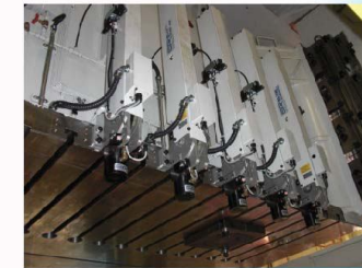
Auto - Travelling Hydraulic Clamp 自走式油壓夾貝